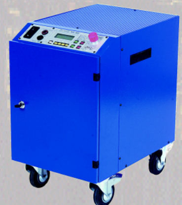
LOAD BANK 8 to 69kW